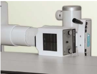
Cross-table procedures can be easily accomplished by the rotational tubestand and optional tube trunnion rings.

The design of this rugged tubestand provides the maximum versatility needed for Orthopedic imaging. Extension of the tubestand beyond the table at either end in addition to angulating the x-ray tube facilitates chest exams and other off-table procedures. Transverse positioning of the tube off-center of the table midpoint (+/- 5") is complimented by a centering detent for fast, precise repositioning of the tube.