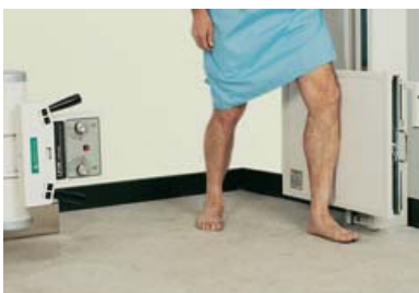
The extended tube travel eliminates the need for a platform during weight-bearing procedures.

Americomp radiographic equipment is completely compatible with most digital imaging systems. Digital imaging technology may be added at any time.