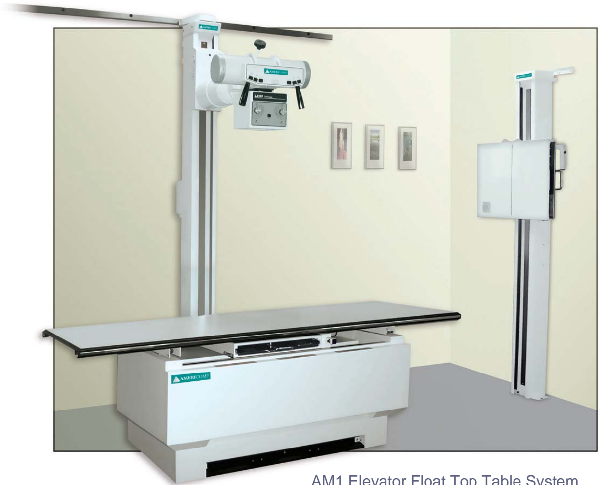
AM1 Elevator Float Top Table System

Versatility for Any Procedure, Reliability for Lasting Performance