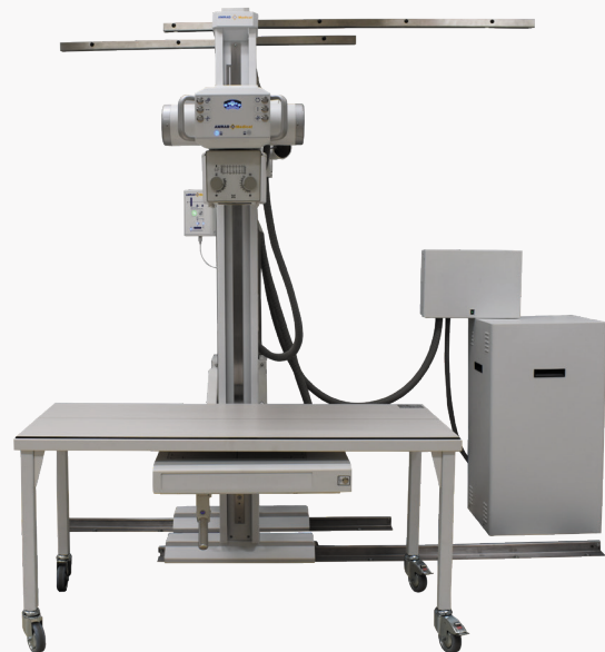
Optional Mobile Table